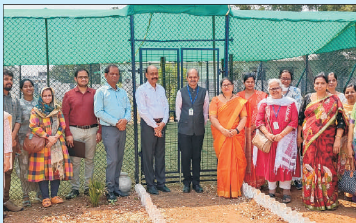
Visit to KVK Demonstration Units on International Women's Day