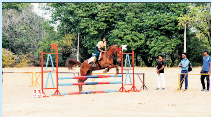
Equestrian Skills of NCC Cadets, CVSc, Tirupati