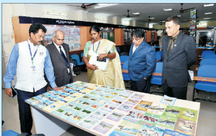
NAAC Peer Team Members Taking a Look at the Literature and Multimedia modules Published in Telugu for the Benefit of Farmers