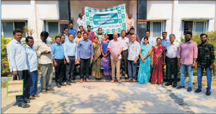
Climate Resilient Agriculture Policy Review Team at KVK, Guntur

KVK, Guntur conducted a workshop on Climate Resilient Agriculture policies in association with NABARD on 26 th March 2024. Scientists of RARS, CRIDA, AMC Amaravati and KVK District officers of DAOs, CEO (APLDA), JD (Animal Husbandry), PD (ATMA), and officials from NABARD, Animal Husbandry department, NGOs, and Farmers have participated in the programme. The proposals for 'Climate Resilient strategies for Guntur district' were reviewed during the programme.