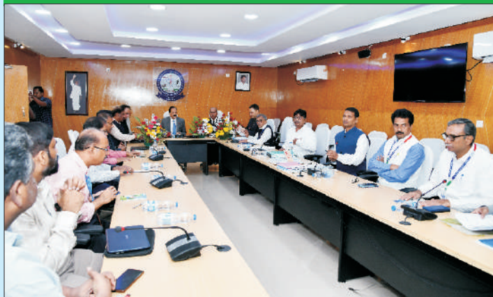
Interaction of NAAC Peer Team with the University Officers