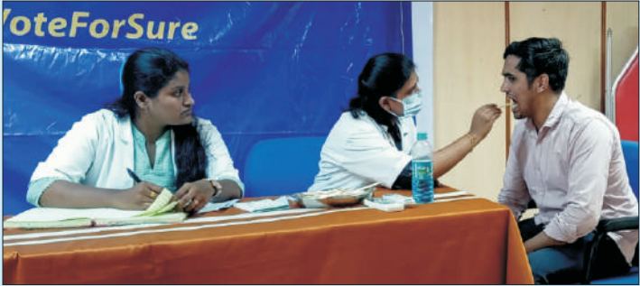
Dental Checkup at Mega Dental Camp