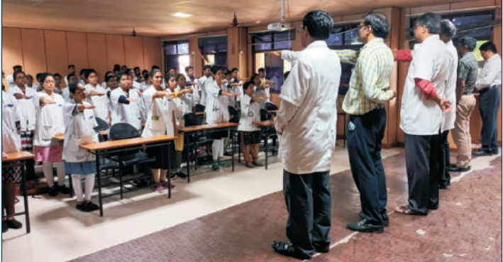
Pledge Taking on National Voter's Day at NTR CVSc, Gannavaram