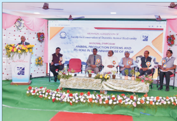
Inauguration of XXI Annual Convention of SOCDAB and National Symposium