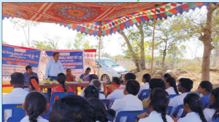
Awareness Programme on Management of Punganur Cattle and Nellore Jodipi Sheep at LRS, Palamaner