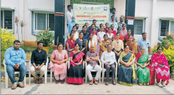
Rural Youth Participants of Training Programme on Mushroom Production with KVK Scientists

A seven-day training programme on 'Mushroom Production' for Rural Youth was conducted from 2 nd to 8 th January 2024. The programme was addressed by ATMA, SAMETI, and KVK officials. Detailed procedures and practices in mushroom cultivation were explained. The topics covered in the programme were Spawn Production Technology, Oyster Mushroom- Standard practices and procedures, Paddy straw - Mushroom- Standard practices and procedures, Pest and disease management in mushroom production, milky - Mushroom -Standard practices and procedures, Mushroom compost and post-harvest technology, Mushroom nutritional benefits and Value addition. Further, the members visited mushroom units in Vijayawada. A total of 30 members participated in this training programme.