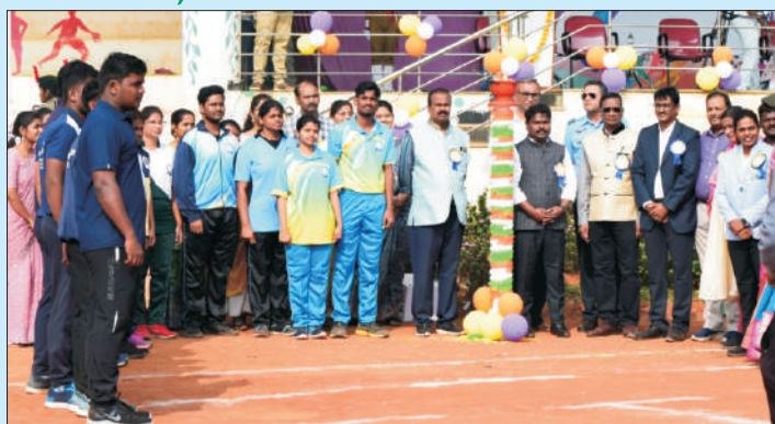
Inauguration of 12 th Inter Collegiate Sports, Games, Cultural and Literary Meet at NTR CVSc, Gannavaram