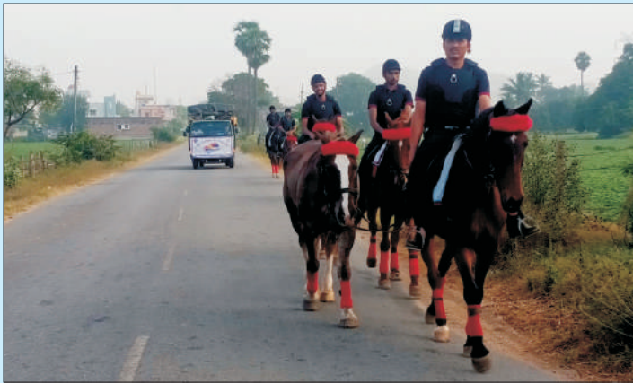
NCC Cadets Embarking on Mounted Expedition

A Mounted expedition camp was organized by 2(A) R&V NCC unit, Tirupati from 25 th February to 2 nd March 2024. The camp started with a flag-off by the NCC commander on first day along with 30 students, 18 PI staff, and 7 horses, halted at IIT Tirupati after a very good horse show. On 2 nd day, a Veterinary medical camp was held at Thondavada village. After a halt at Srikalahasthi on 3 rd day, a horse show was organized on 4 th day at KVB Puram village high school. A horse show jumping was organized along