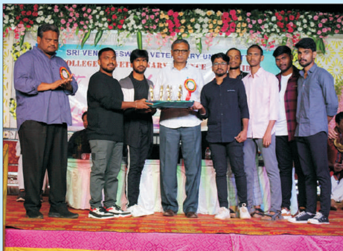
First Collage Day Celebrations at CVSc, Garividi