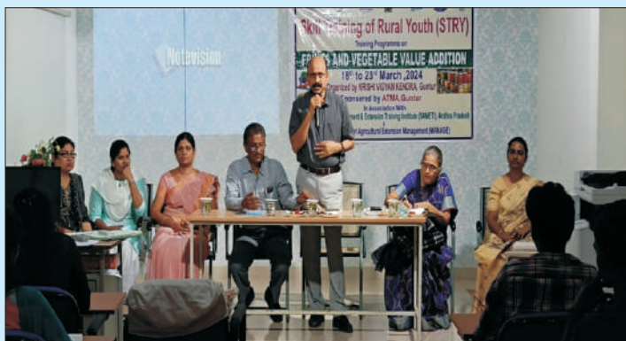
Inauguration of Training Programme on Fruits & Vegetables Value Addition