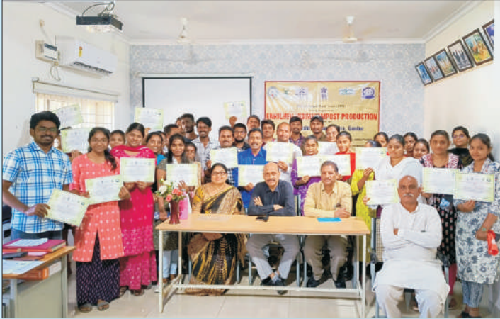
Participants of Training on Enriched Vermicompost Production