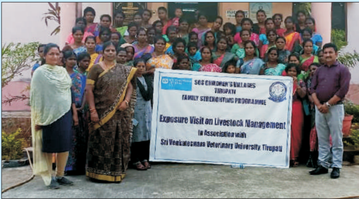
Participants of Training Programme at CCVEC, Tirupati