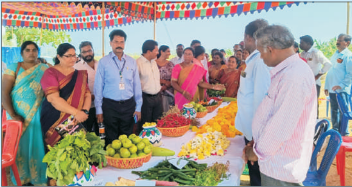
Natural Farming Farm Produce at Display