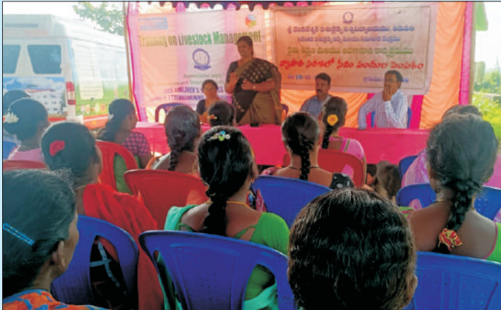
Women Farmers Attending the Awareness Programme on Pig Rearing